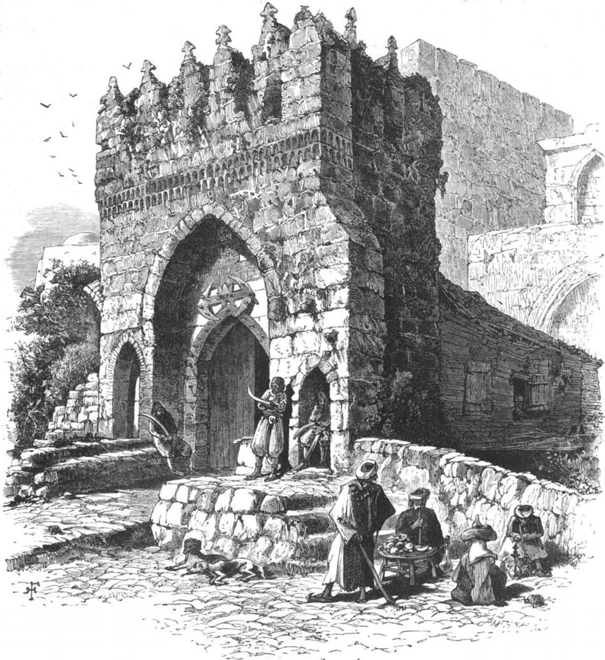
ENTRANCE TO THE CITADEL.

Immediately beyond the Kedron Valley, “before” or to the east of Jerusalem, is the Mount of Olives (see page 8), a long ridge of graceful outline, swelling out ever and again